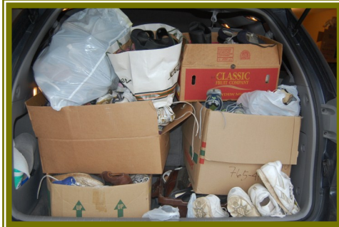
Shoes packed for delivery to the shelter.