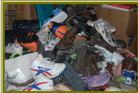
More shoes for the shelter

When we put waste into our landfills, we are essentially squeezing it as flat as we can and putting it into an enormous plastic or cement lined space. Why? Well we're done with it, aren't we? We want to keep it away from our homes and businesses; from the air we breathe; from the land we live, walk, and play on; from the water we use in our homes and businesses; and from the water we drink. In order to make this happen, we have to keep the air and the rain-water, the snow melt and the wildlife out of the landfill. Trash in a landfill doesn't decompose very much. In fact, if you dug down into a landfill to the trash that was placed in it 40 years ago and found a newspaper, you would still be able to read the print on the pages.